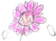
Red chinese Rose

Find plants, trees, animals and insects in that area and draw them. Then try to find out their names.